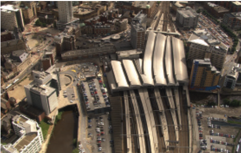
The Railway Station in Leeds City Centre.