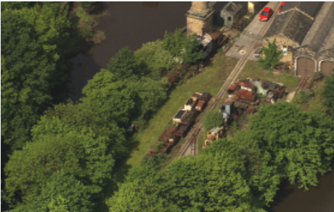
The railway running into Armley Mills.