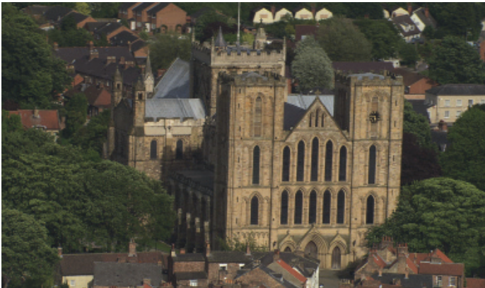
Known as the 'Cathedral City of the Yorkshire Dales', Ripon is the fourth smallest city in England.